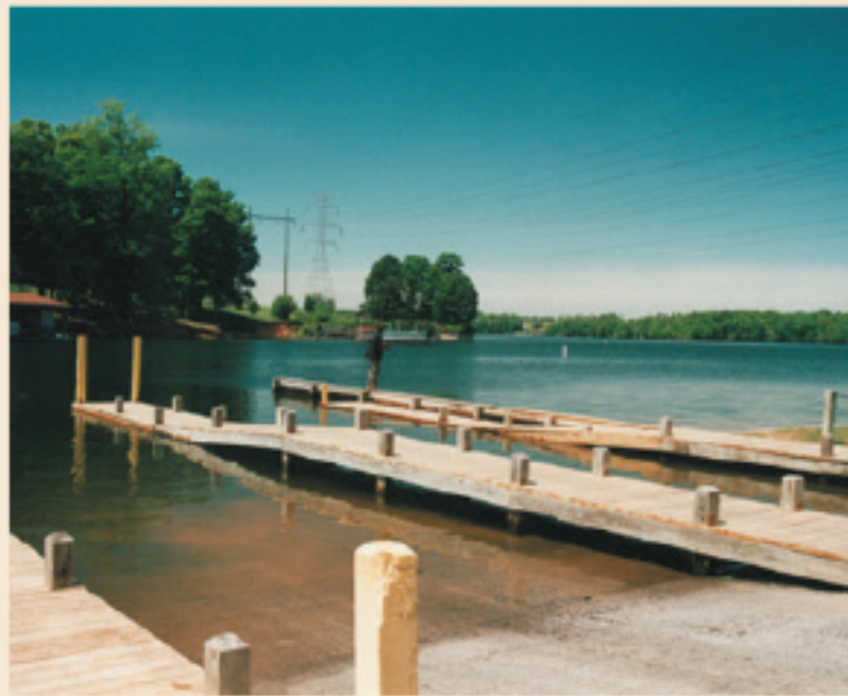
Roanoke Rapids Lake