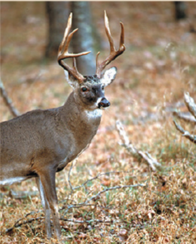
Wildlife on the trail