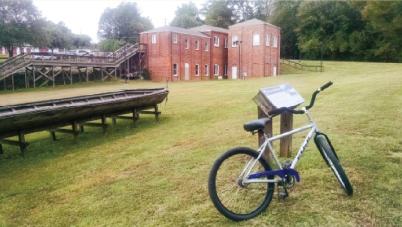
Roanoke Canal Museum

Trail Note: The trail from Roanoke Rapids Lake to the Canal Museum is generally flat except a steeper hill with a 90 degree turn near the RR Lake Dam; from the Canal Museum to River Road is generally flat; from River Road to River Falls Park in Weldon is generally flat except near the co-gen plant where there are some rolling short hills. Hikers, joggers, and bicyclist should be careful of exposed rocks and roots.