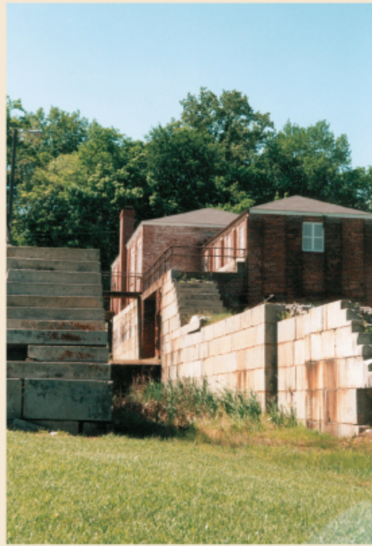
Roanoke Canal Museum